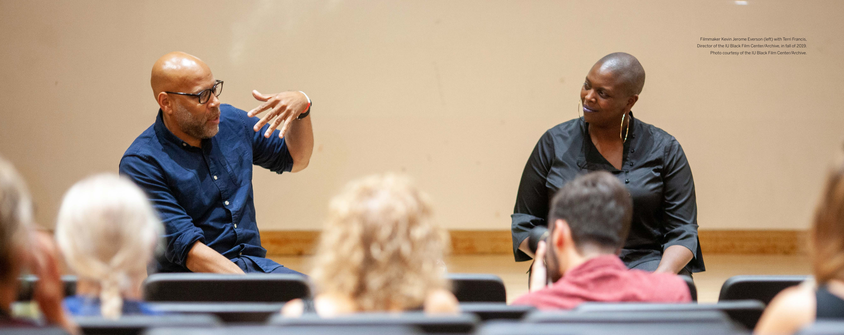
Filmmaker Kevin Jerome Everson (left) with Terri Francis, Director of the IU Black Film Center/Archive, in fall of 2019.