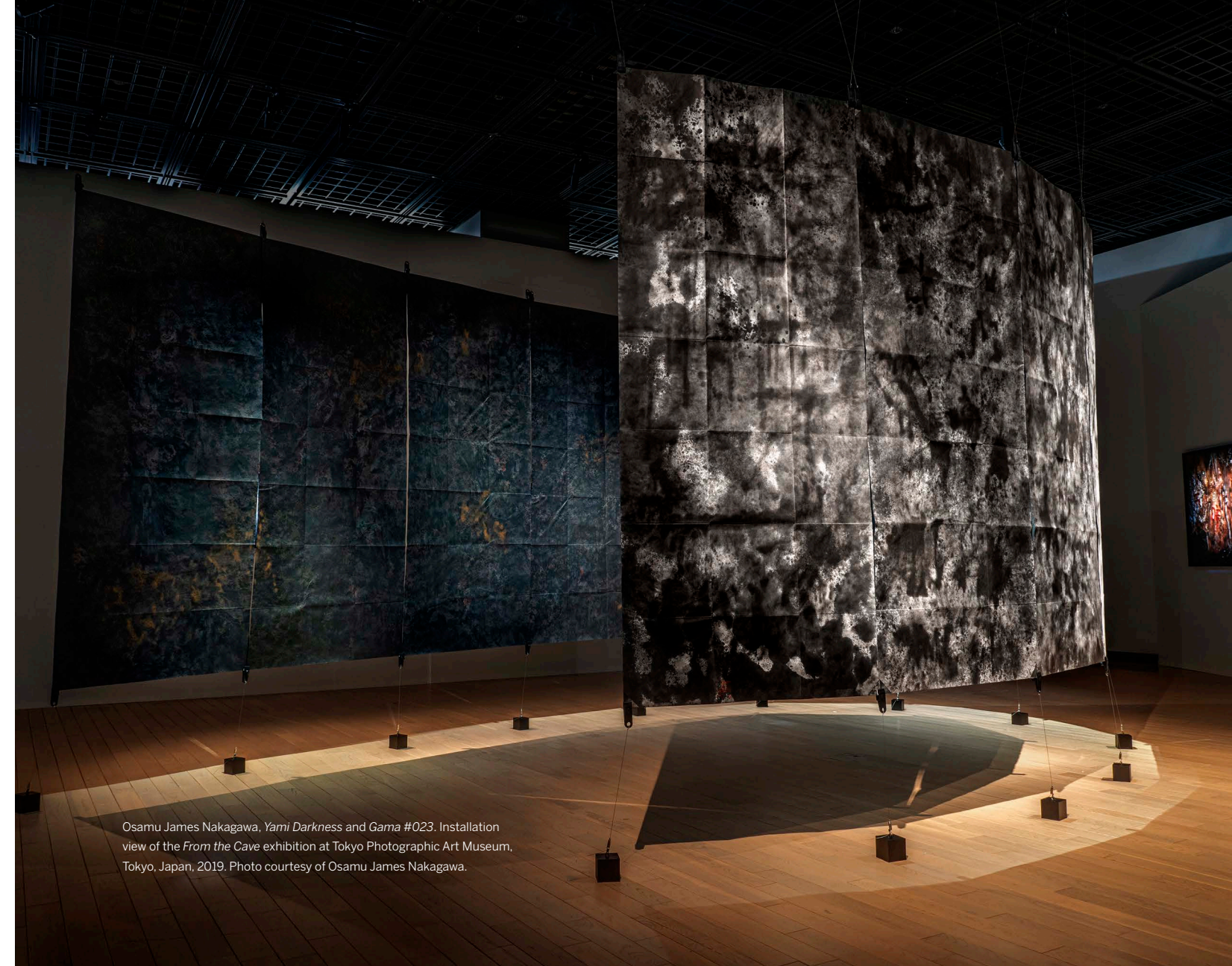
Osamu James Nakagawa, Yami Darkness and Gama #023 . Installation view of the From the Cave exhibition at Tokyo Photographic Art Museum, Tokyo, Japan, 2019.