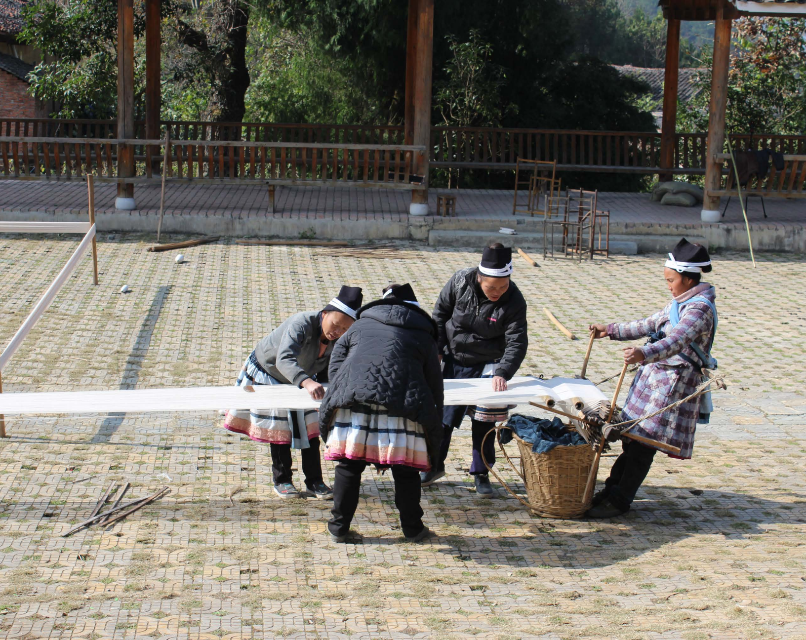
Right: Baiku Yao women prepare a loom for weaving near Huali village, Nandan County, Guangxi, China. December 17, 2017.

May 2022 • Textile Arts and Heritage Practices in Southwest China: A Workshop and Symposium (details to be announced). Extending a binational research project that began in 2017, Textile Arts and Heritage Practices in Southwest China will include a book workshop and a campus-facing symposium examining textile arts among the minority nationalities of China’s mountainous Southwest. Of central concern is the impact of China’s extensive heritage policies on both arts and communities. For more information, contact Jason Baird Jackson (Folklore and Ethnomusicology at IU Bloomington).